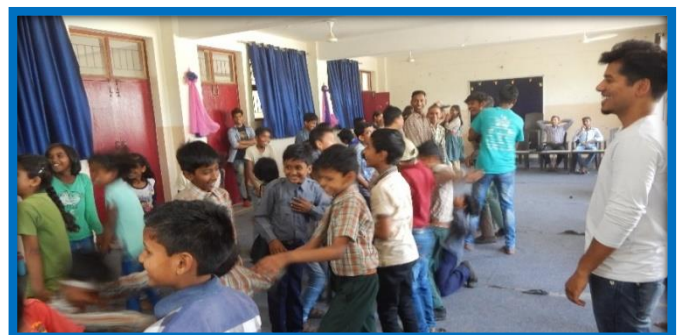
Children taking part in activities

Khatima: Children, along with their parents and teachers, at Khatima came together to celebrate Gandhi Jayanti. The children paid homage to Mahatma Gandhi, by singing a few patriotic songs. A workshop on hygiene and cleanliness was conducted for children and their parents. Later a cleanliness drive was also organized in and around the Centre which saw enthusiastic participation from the kids.