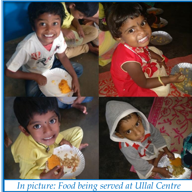
In picture: Food being served at Ullal Centre