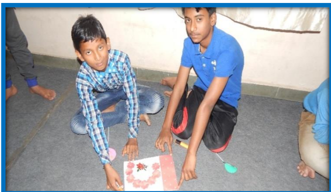
Greeting Card making

Khatima, Saharanpur: Drawing competitions were conducted on Independence Day on the theme 'India'. It was mind-blowing to see children draw their thoughts about the country showcasing Unity in Diversity. Rangoli and Greeting card making events were also held to persuade patriotism through art.